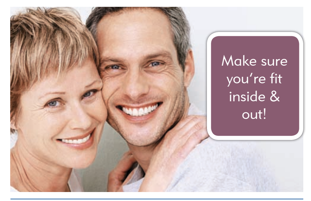
Making gorgeous smiles affordable

We really care about you, so if it's been a while since your last appointment, please call us today.