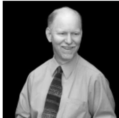
DOCTOR OF DENTAL SURGERY Loma Linda University