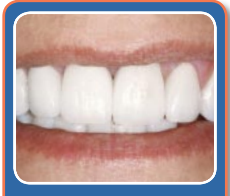
Regained perio health plus veneers

Here are some links that have been demonstrated between oral health and overall health.